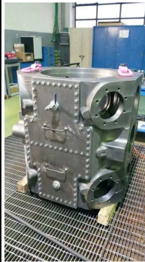
This was the compressor’s cylinder in question

While He was drying– at the end of a hydraulic test– a compressor’s cylinder, a contractor’Operator was hit in the left eye by dust, notwithstanding He was dressing safety glasses.